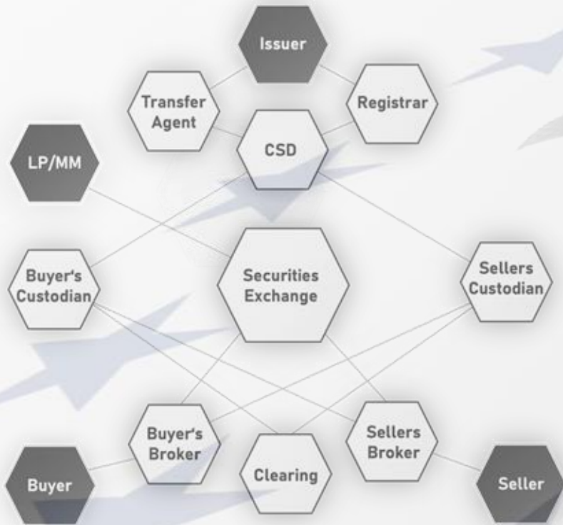
Capital markets are complex & expensive