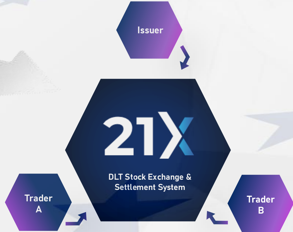
DLT capital markets are simple & efficient